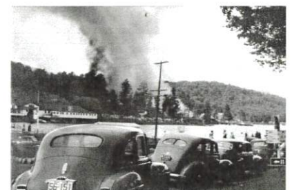
Campground Fire 1945 Came to be

7:00 pm—Video of the 1945 Fire and other stories of our past Presented in the Youth Center